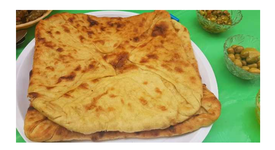
Submitted to Rural Women Development Society